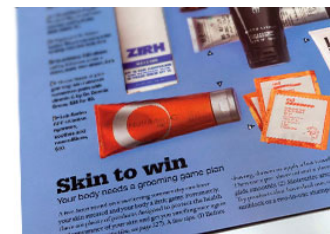
NutriMenC® RE® Featured in Golf Digest Magazine

“Skin care market booms, due to skin care being recession proof.” 5/16/08 Decision News Media“